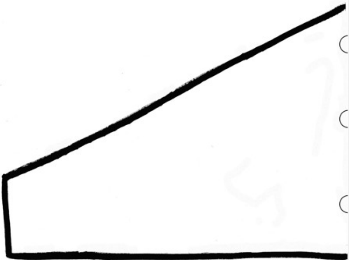
Nursing Sleep Bra size medium